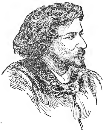
ALPHONSE DAUDET In 1868.

fleece of his long black hair, he had the face of some young god in the guise of a herdsman of the Abruzzi